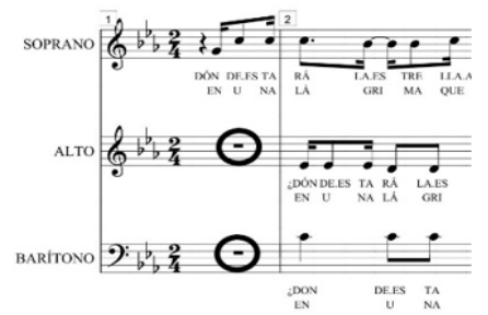
Illustration 7: altos and baritones wait for their entrance in the following beat.

Finally, Calsamiglia and Tusón (2001) take titles into consideration. They claim that they have cataphoric reference since they anticipate the content of the text. The musical score is identified by a specific title, which is La Estrella Azul (Illustration 6). In this case, the song is expected to deal with a blue star and not, for example, cars. The name of the song is also part of the lyrics: ¿Donde estará la estrella azul, esa estrellita del alma? What is more, under the song title, we see the word Huayno . The presence of this subtitle is significant since it allows the reader to classify the song within a musical genre and, thus, they can be aware of what style it should follow (provided they have previous knowledge about the general characteristics of a Huayno).